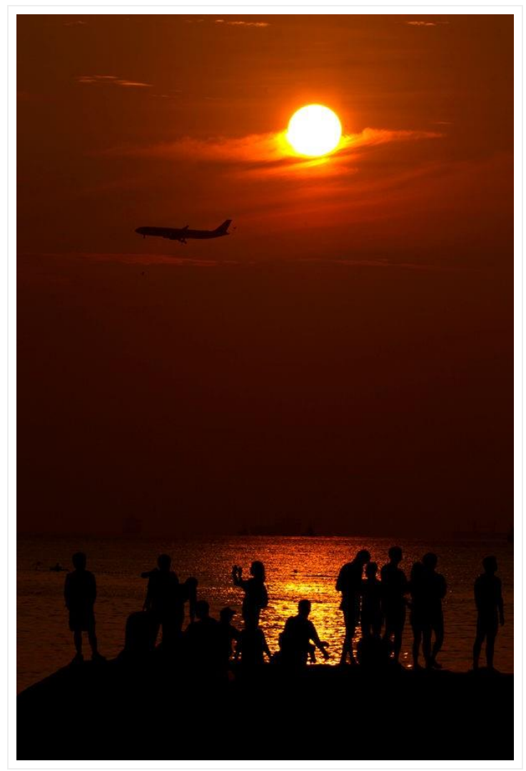
The Singapore Aviation Centennial Exhibition highlights the milestones that have shaped the industry today

In the open category, participants were invited to submit images that best illustrate the multifaceted aviation industry. Ng Wei Chean's winning photograph, titled "Reflections of Aviation" (above), is a collage depicting a variety of interesting activities at Changi Airport.