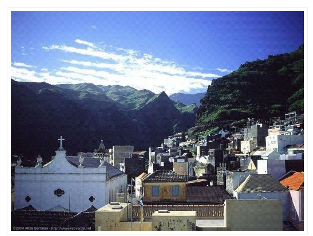
Cape Verde, an island country spanning an archipelago of 10 islands located in the central Atlantic Ocean, off the coast of Western Africa. Its economy is mostly service-oriented with a growing focus on tourism and foreign investment.