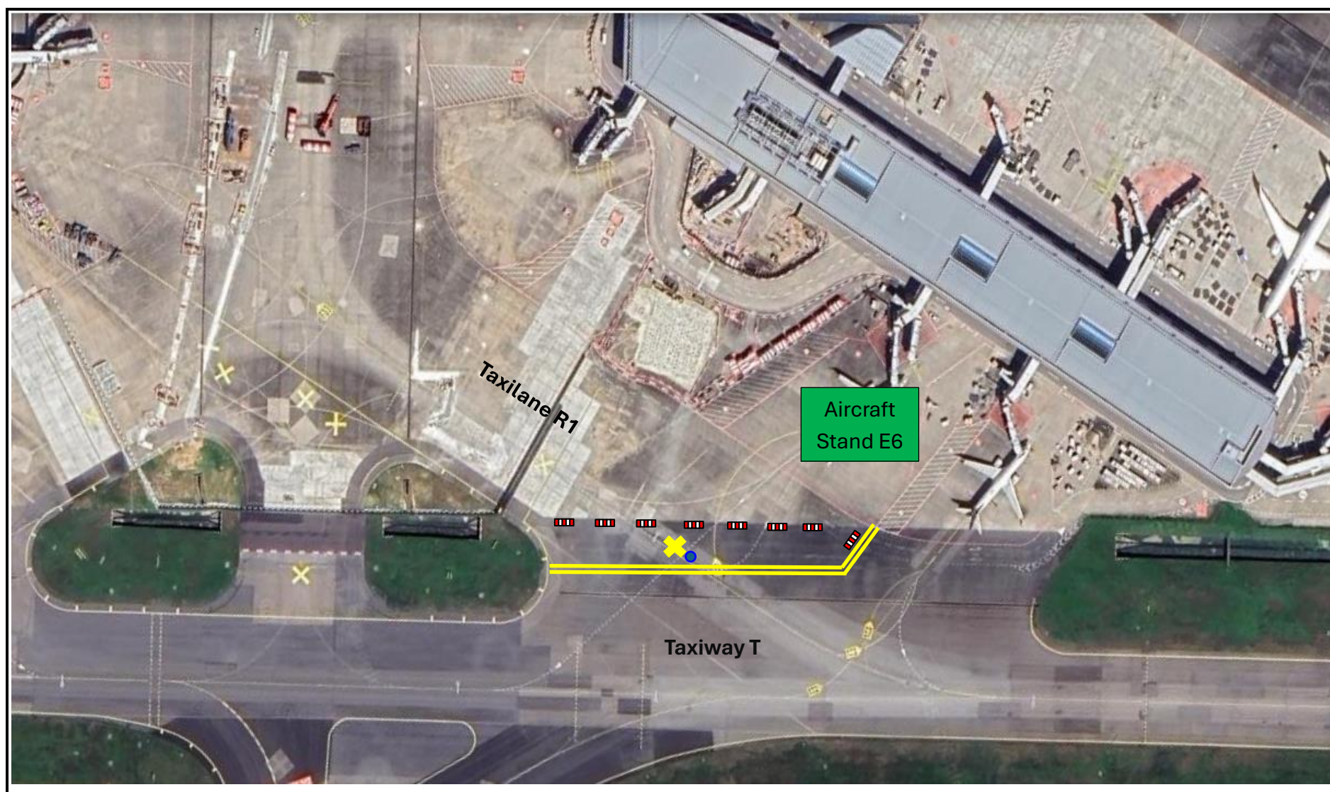
Diagram for illustration purpose only and not to scale